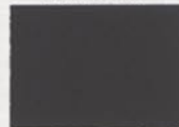
Dark Gray CC230/4