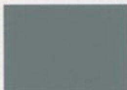
Philly Blue CC570/5 Requires Blue Pigment

Colors shown approximate laboratory samples made with type-1 portland, tan sand, Color-Crete™ pigment and 4" slump.