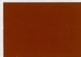
Cherokee Red CC153/5