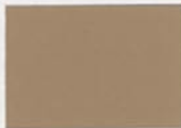
San Jose Buff CC715/1.5